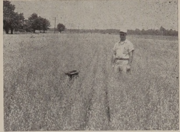
Longest Bros. field of FULWOOD Oats yielded over 100 bushels per acre.

Atlas has made record yields and is recommended from Louisiana to Maryland. It has very dark green foliage, vigorous fall and winter growth, and is the best for winter pasture. It has stiff medium tall straw, easy to combine.